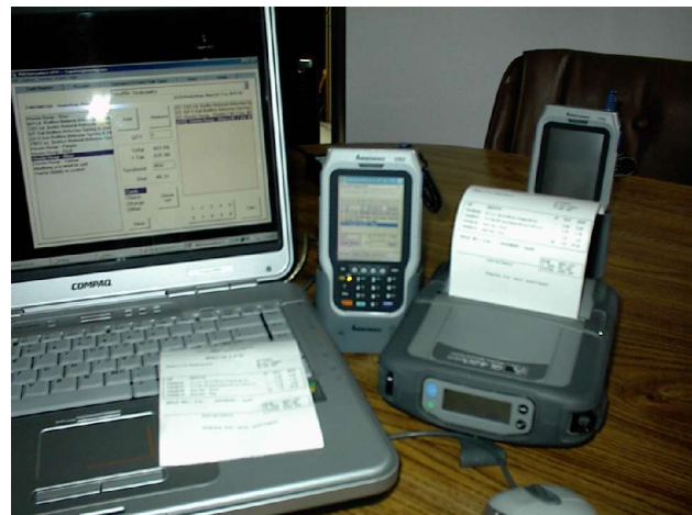
XP Laptop, Intermec CN2 PDT and Zebra RW-420 mobile printer running POS Everywhere

Price includes both (1) Mobile device and (1) PC license, Mobile license packs are also available.